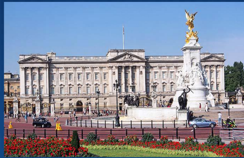
England Heritage Tour 28 July