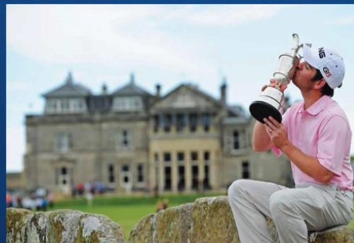
The British Open - Scotland