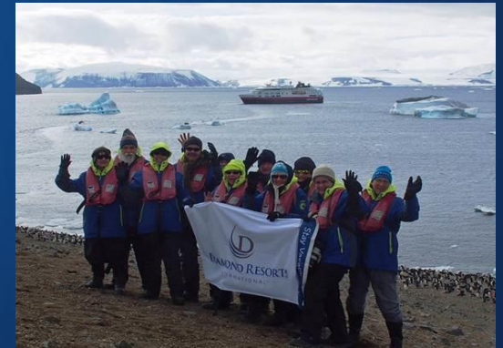
Antarctica - October 2017

The Galapagos Islands Adventure is sold out for November 2017. Watch our Facebook page for photos!