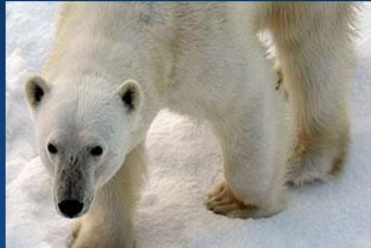
Svalbard Polar Bear Adventure June 2017