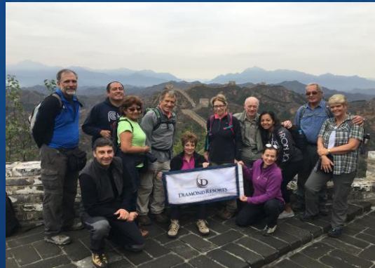
Great Wall of China – October 2017