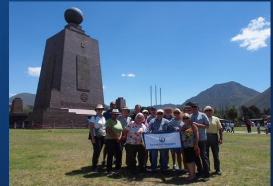
Middle earth – Ecuador June 2017