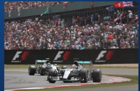
Formula One Worldwide locations