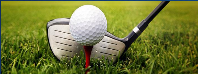
The Ryder Cup