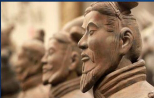
Splendors of China (optional Tibet extension) 11 October