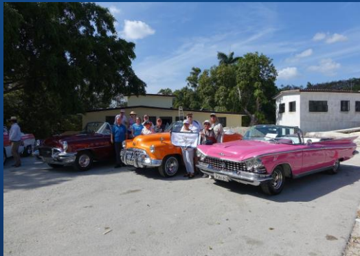
Cuba - April 2017