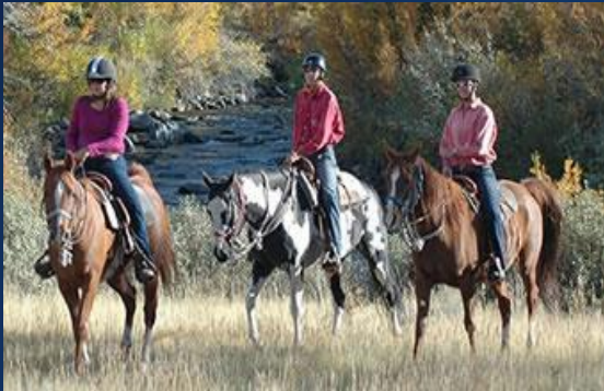
Wyoming Horseback Riding June 2017