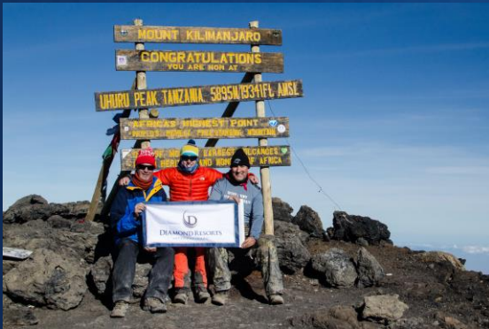
Mount Kilimanjaro - October 2017