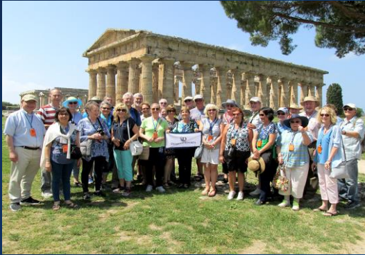
Italy - June 2016