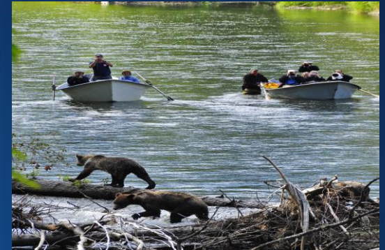
Canadian Wilderness September 2017