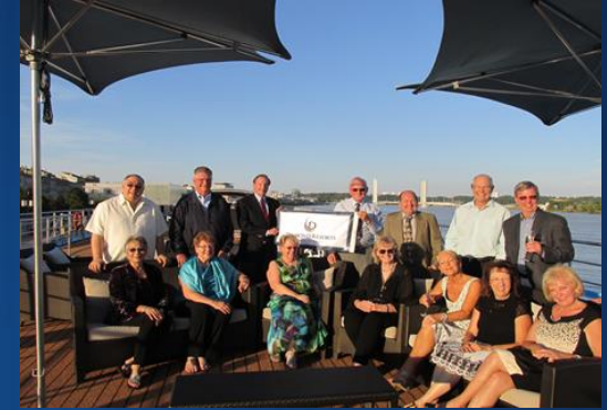
River Seine – August 2016