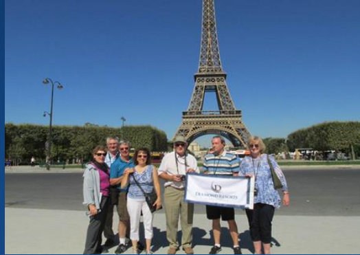
Bonjour from Paris! August 2016