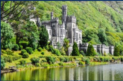
Essential Scotland 21 and 29 September