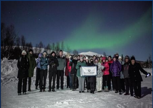
Northern Lights - March 2017