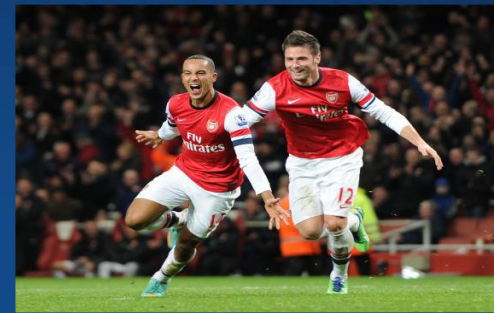
Premiership/European Football & Champions League Final