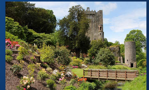
Ireland (two itineraries) 10 May, 22 July and 23 September