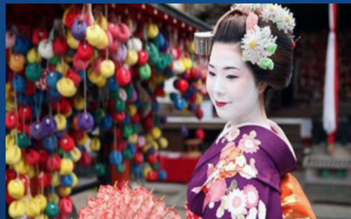
Discovering Japan by Rail (Gold & Platinum only) 13 March