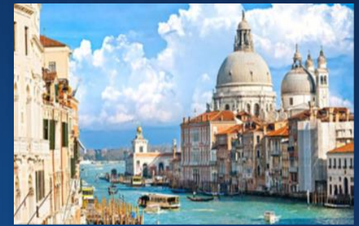
Adriatic Mediterranean Journey Venice to Croatia 4 July