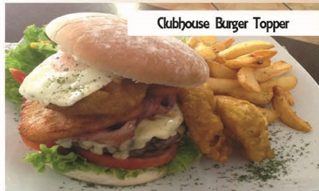
Clubhouse Burger Topper