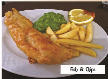
Fish & Chips

Top it Off with our fantastic Toppers The Choice of Cheese, Bacon, Egg, Chilli, Pineapple, Onion Rings, Hash Browns or Blue Cheese. Toppings €1,00 each.