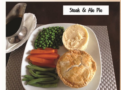
Steak & Ale Pie

Good Old Sausage & Mash €9,95 HB Succulent Cumberland sausage oven cooked, served on a bed of creamed potato, with a delicious onion gravy